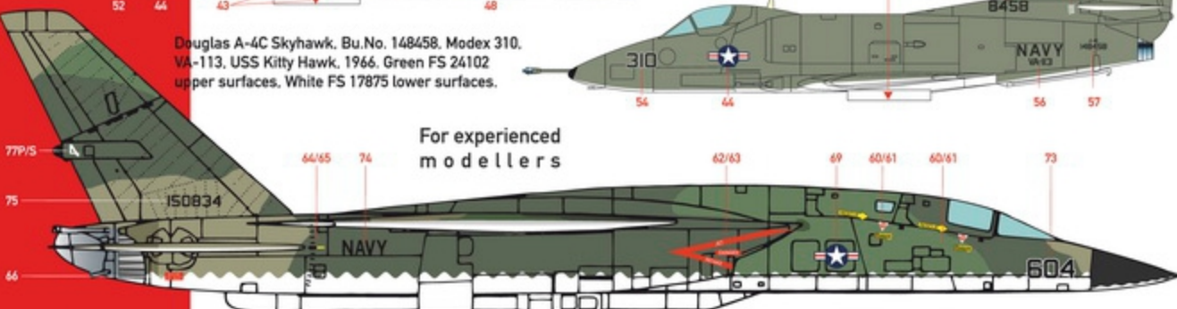
North American RA-5C Vigilante, Bu.No. 150834, Modex 604, RVAH-13 'Bats', USS Kitty Hawk, 1966.

Dark Green FS 34079, Field Green FS 34097, Tan Brown FS 34201 upper surfaces, White FS 17875 lower surfaces, Radome upper surface - Black.