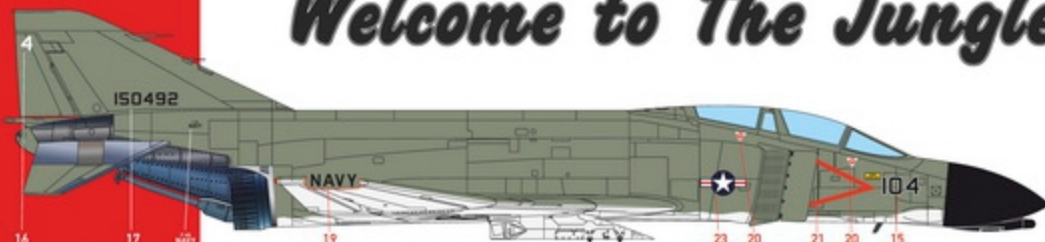
McDonnell F-4G Phantom II, Bu.No. 150492, Modex 104, VF-213 'Black Lions', USS Kitty Hawk, 1966. Green FS 24102 upper surfaces, White FS 17875 lower surfaces, Radome - Black.