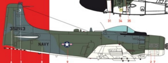
Douglas A-1J Skyraider, Bu.No. 142016, Modex 501, VA-115 'Arabs', USS Constellation, 1966. Dark Green FS 34079, Dark Grey FS 36081 upper surfaces, White FS 17875 lower surfaces, Anti glare panel - Black.

Douglas A-1J Skyraider, Bu.No. 135263, Modex 503, VA-115 'Arabs', USS Constellation, 1966. Dark Green FS 34079, Dark Grey FS 36081 upper surfaces, White FS 17875 lower surfaces. Anti glare panel - Black.