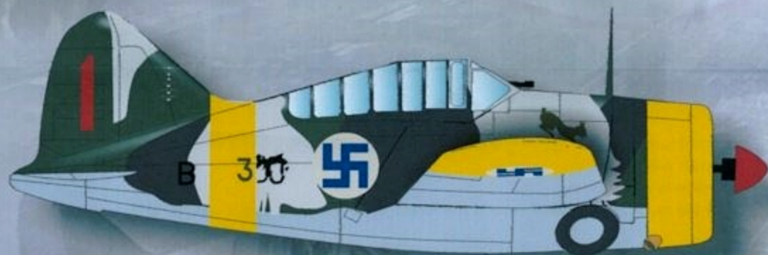
5 Brewster Model 239, BW-368, 3/LeLv 24, flown by Sgt. Katajainen, March 1942

Colours: Black(FS 37038) Olive Green (34096) Light Grey (FS 36440) Yellow (FS 13655) White