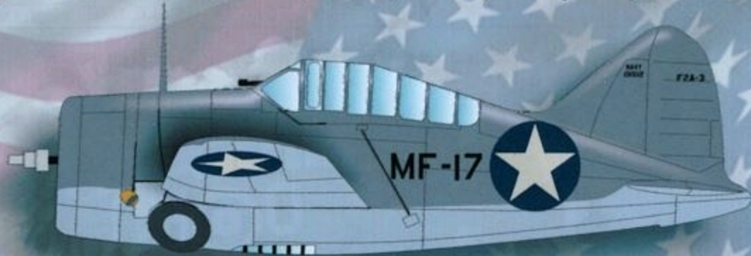
4 F2A-3P, BuNo 01512, VMF-221, flown by 2Lt. Kunz, Midway Island, June 1942

Colours: Non-Specular Blue-Gray (FS 35189) over Non-Specular Light Gray (FS 36440).