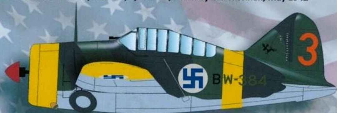
6 Brewster Model 239, BW-384, 2/LeLv 24, flown by 2Lt. Nissinen, May 1942

Colours: Black(FS 37038) Olive Green (34096) Light Grey (FS 36440) Yellow (FS 13655)